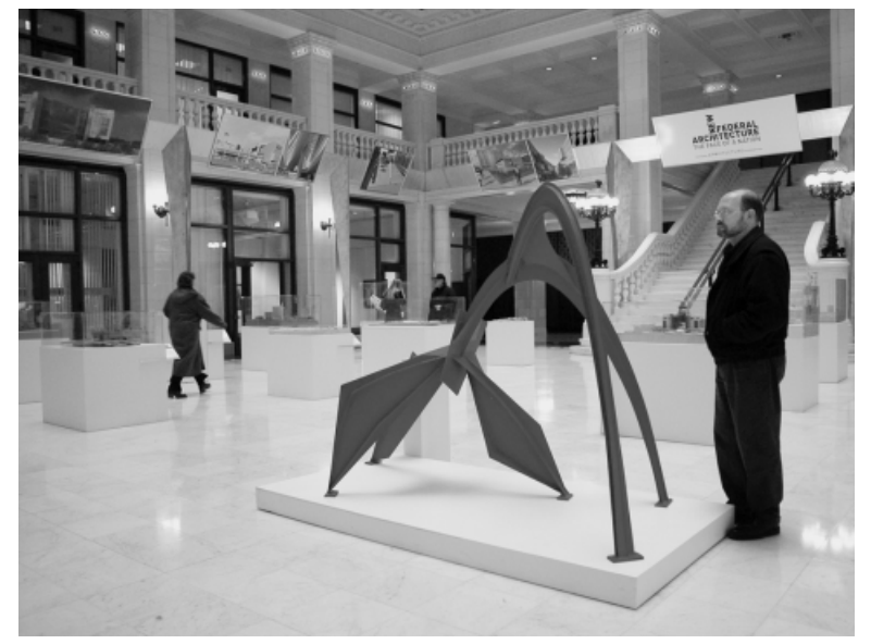
A visitor inspects the 6-foot-tall Calder stabile miniature that is part of the "New Federal Architecture: The Face of a Nation" exhibition in the Santa Fe lobby through May 2nd.

The "Flamingo" model is at the Santa Fe Building as part of "New Federal Architecture: The Face of a Nation," a major traveling exhibition organized by the Design Excellence Program of the