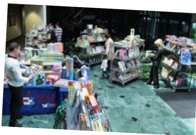
At right: The new fair at 450 Devon. These Spring fairs, as well as a third one at 300 Park, gave tenants a convenient way to buy a large selection of current best sellers, how-to volumes, inspirational books, children's books, gifts and more. A donation to Clearbrook was made from fair proceeds.