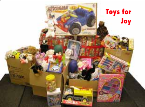
Toys for Joy